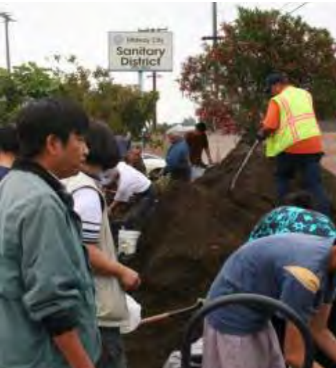
Many residents took part in OCSD's free biosolids-compost giveaway at this 2007 Midway City Sanitary District event.

We work with local cities and residents to let them know that compost keeps gardens green, conserves water and even helps combat climate change, while keeping sewer rates low.